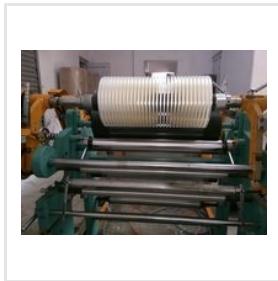
Bopp Film Slitting Rewinding Machine