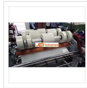
PVC Film Slitter Machine