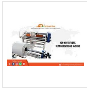
Non Woven Slitting Rewinding Machine