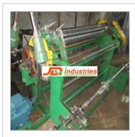
Light Duty Kraft Paper Slitting Rewinding