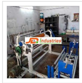
Polyester Film Slitting Machine