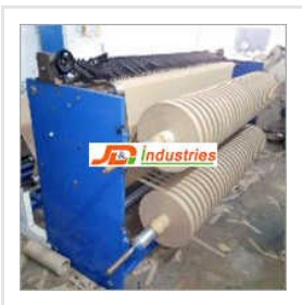
Fabric Slitting Machine