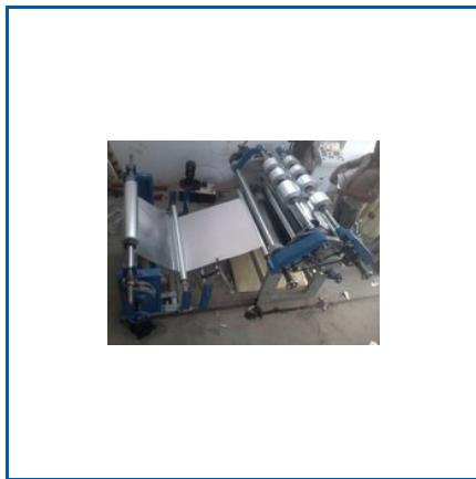
ALUMINIUM FOIL SLITTING REWINDING MACHINE