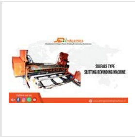
Surface Type Slitting Rewinding Machine