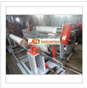
Roll Slitting Machines