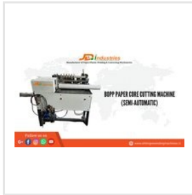
BOPP Paper Core Cutting Machine (Semi Automatic)