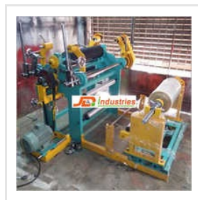
Film Slitting Rewinding Machine