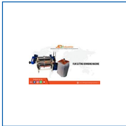
PLASTIC FILM SLITTER REWINDER MACHINE