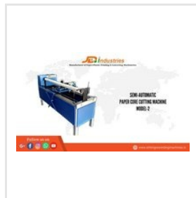
Semi-Automatic Paper Core Cutting Machine Model 2