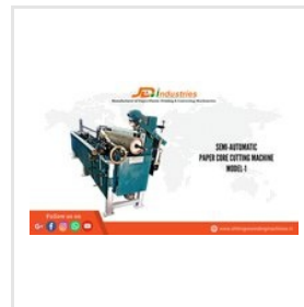
Semi Automatic Paper Core Cutting Machine Model 1