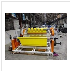
Heavy Duty Slitting Rewinding Machine