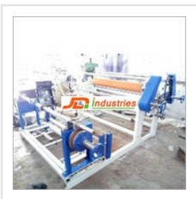
Fabric Slitting Rewinding Machine