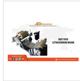
Kraft Paper Slitting Rewinding Machine